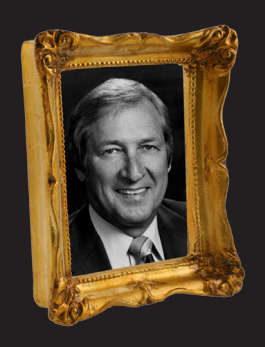
Where the Past and Future Meet