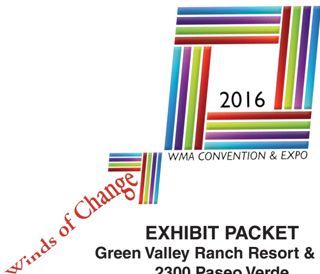
EXHIBIT PACKET Green Valley Ranch Resort & Spa 2300 Paseo Verde Henderson, NV 89052